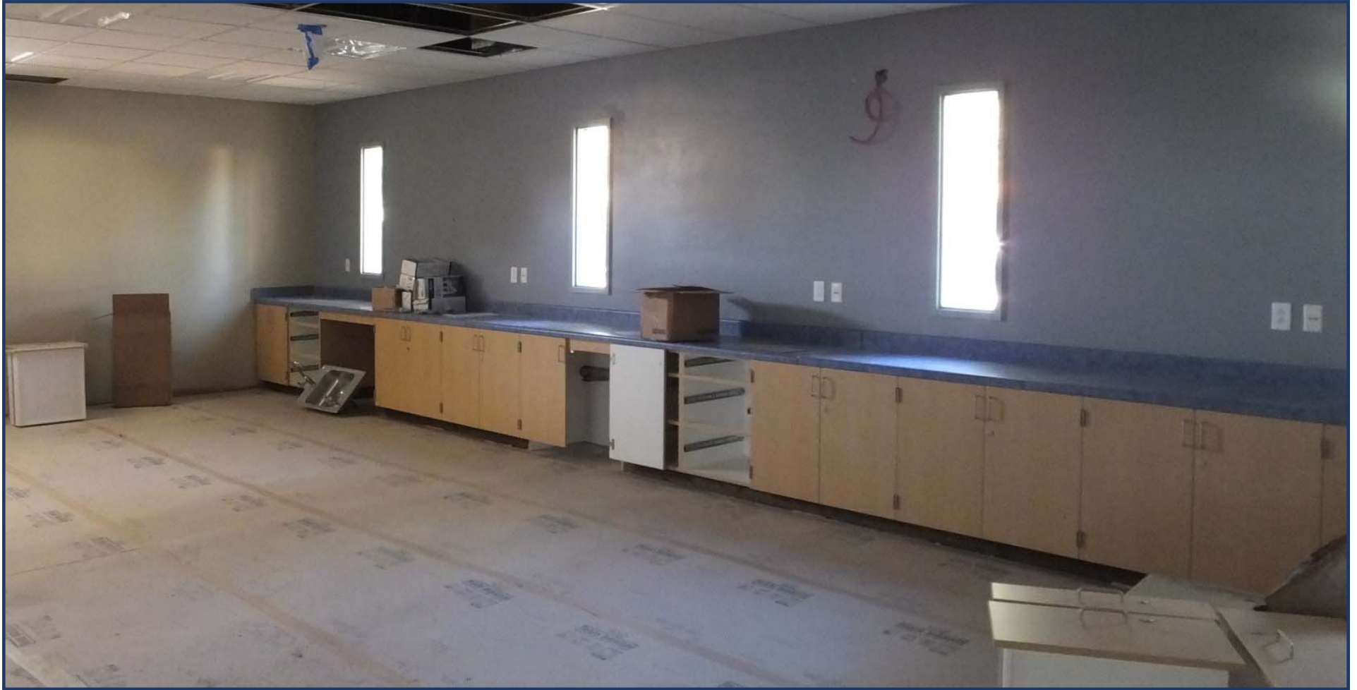
Toyon FIS – Maker Space