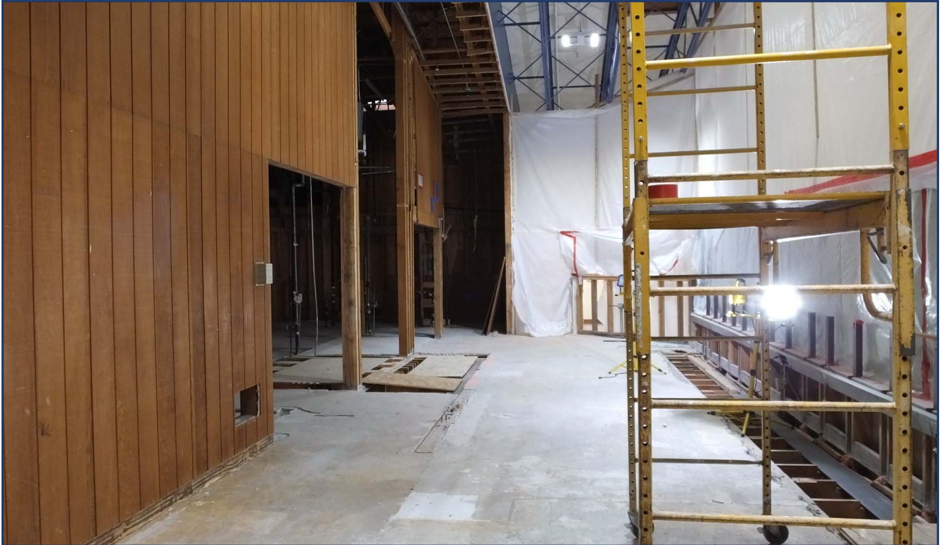
Cherrywood FIS – Front FIS Space Looking East- April