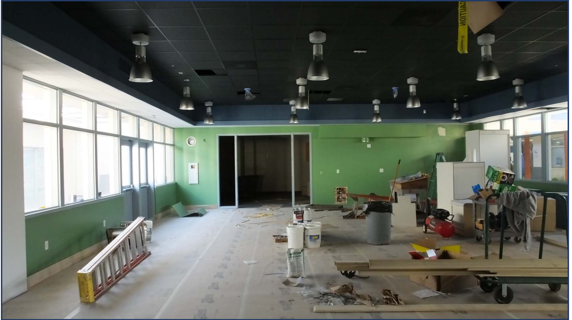
Toyon FIS – Looking West - April