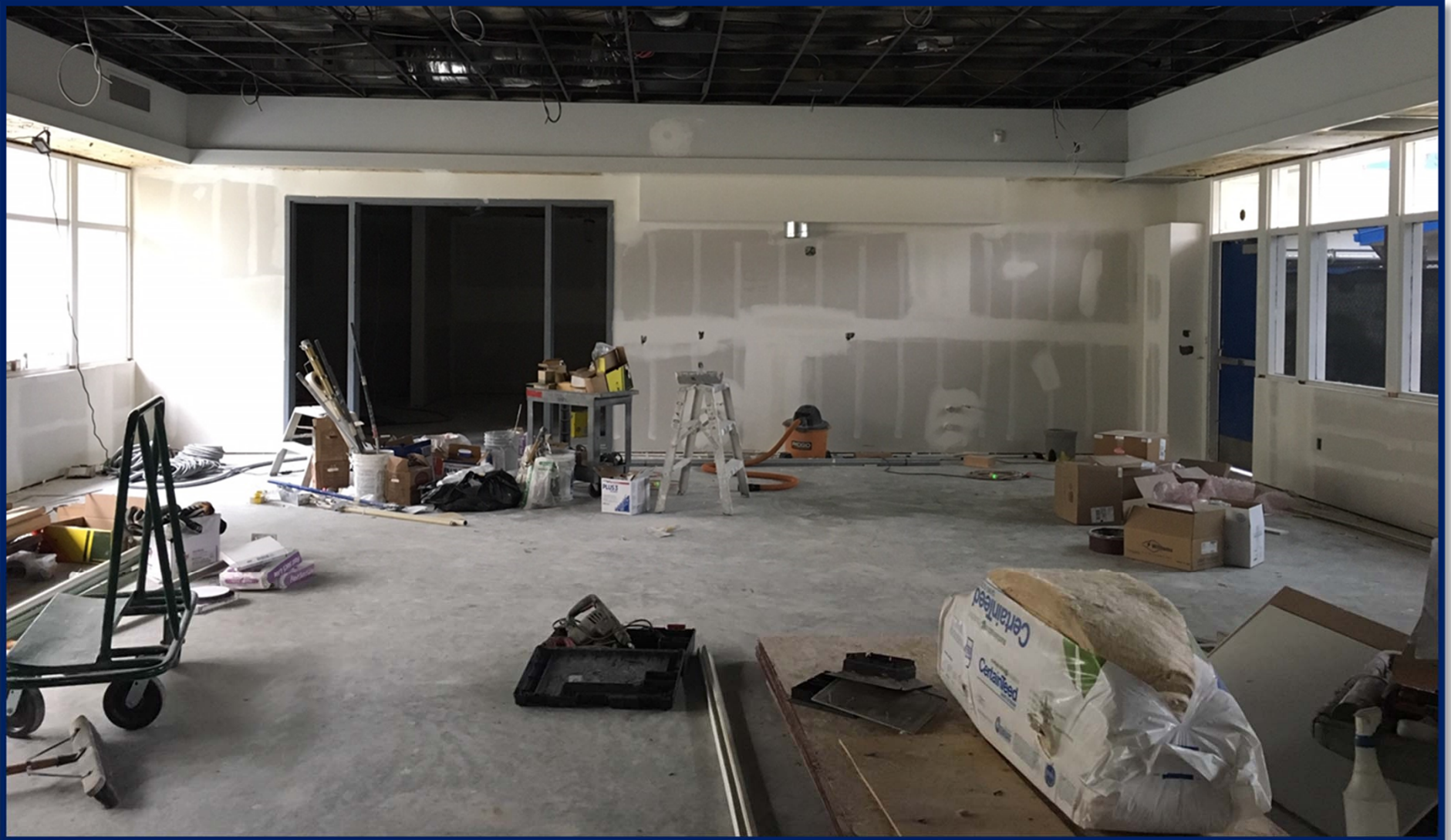
Toyon FIS – Looking West - March