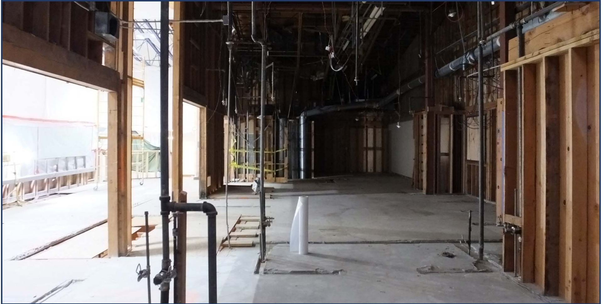
Cherrywood FIS – FIS Space Looking West- April