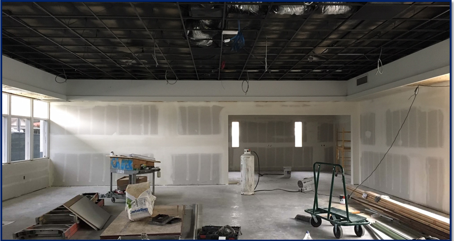
Toyon FIS – Looking East - March