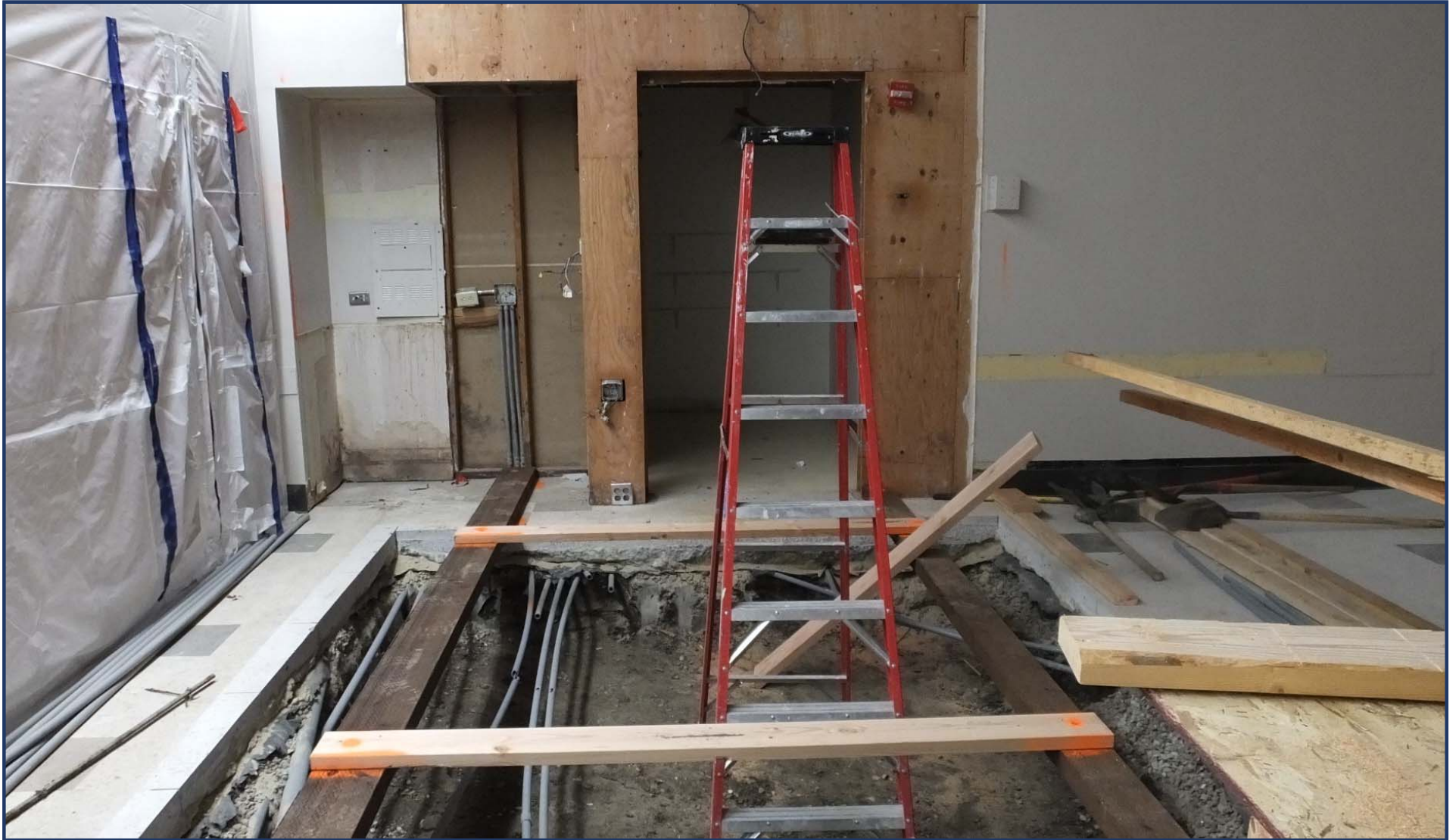
Cherrywood FIS – Kitchen Area - April